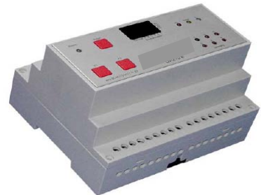
Gas Limit Monitors