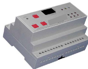
Gas Limit Monitors