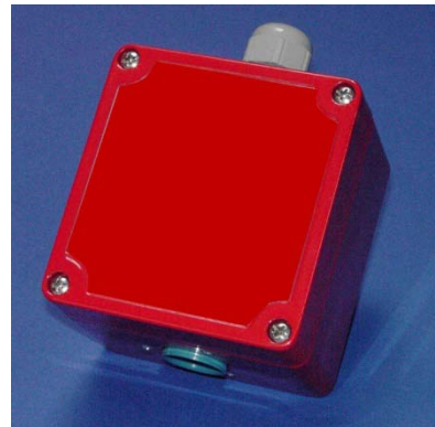
NH 3 Gas Measuring System

The measuring system offers a range of 0-100ppm NH 3 .