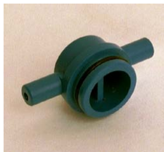
Test Gas Cap

MODBUS solutions and Gas Limit Monitors/Controllers are also available with this system. Please ask Euro-Gas for details.