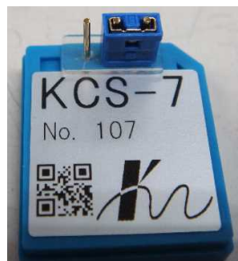
Fig. 1 Sensor image